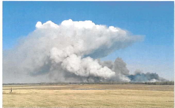
Massive banks of smoke dotted the horizon around Shellbrook on Saturday May 12, when the Rally wildfire started near Holbein. The blaze was declared "out" as of June 7.

"Wildfire investigators have determined that the Rally Fire was human-caused, based on the absence of any reported light-